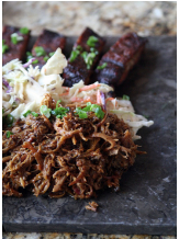
Bounty Hunter BBQ

"Cheeseburger Wednesdays" feature a flight of the Valley's finest red wines alongside Idaho Kobe Beef Burgers with Cabot Cheddar on locally made buns. Other specialties include St. Louis cut ribs ($12-$24) and pulled pork, beef brisket, and shredded barbecued chicken sandwiches ($12-$13.50). An array of sides such as green salad, cole slaw, cornbread and house-made half-sour pickles are available in individual ($1-$5) and family size ($6-$15) portions.